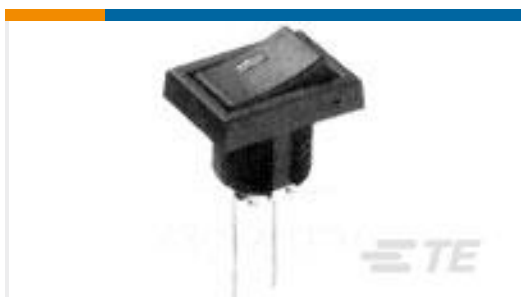
TE Part #5-1437595-2 TRD11F10WL=SUB MINI ROCKER BLA