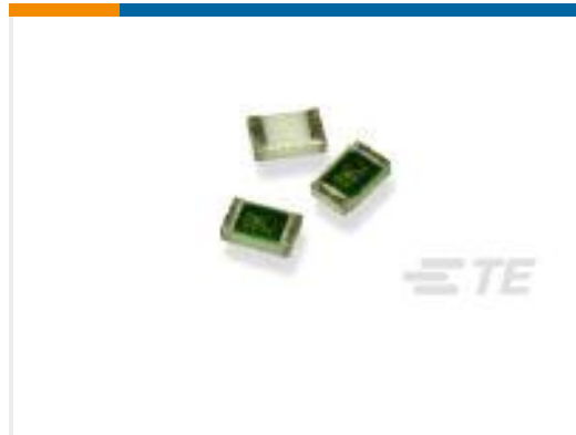
TE Part #9-1614882-9 CPF 0603 22R 0.1% 25PPM 1K RL