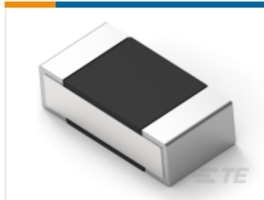
TE Part #9-2176306-1 RP 1E 0.1W 10K 0.1% 25PPM 5K RL