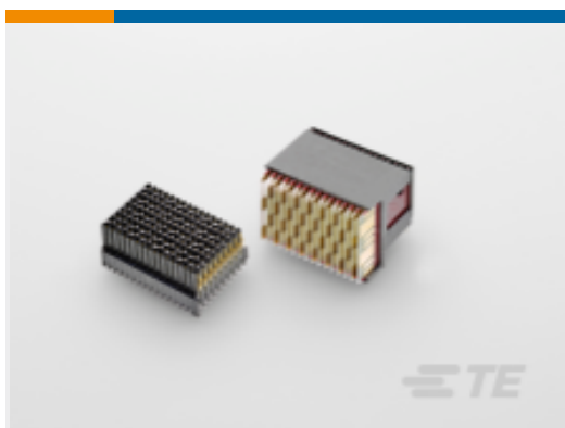
TE Part #2332816-1 RA Plug Assy Left End Multigig RT 3