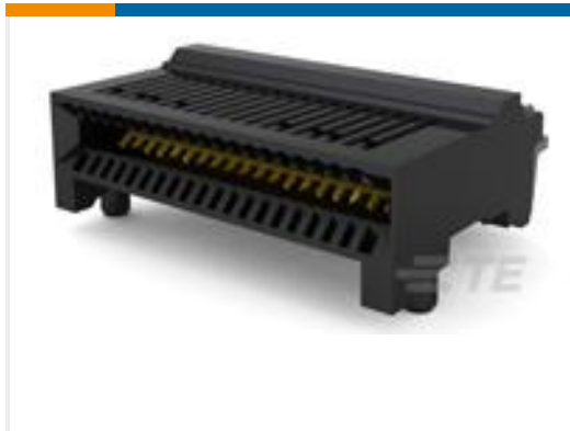
TE Part #1551920-2 zQSFP+ connector assembly