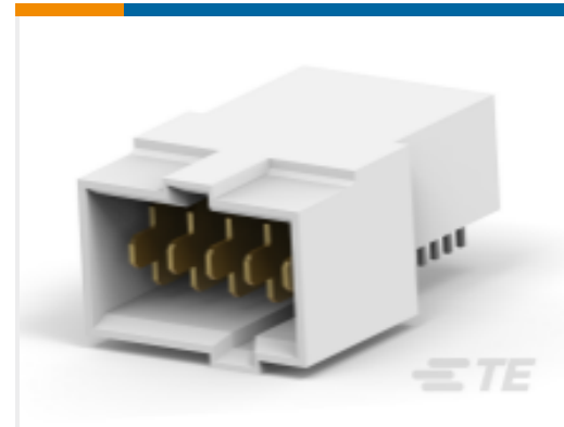
TE Part #1982260-5 Z-PACK Slim UHD Power 5 pos pl