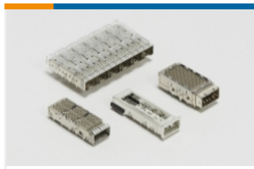
Pluggable IO Connectors &amp; Cages(424)