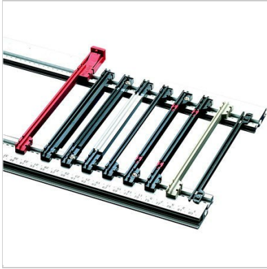
Photo: 2nd guide rail from left