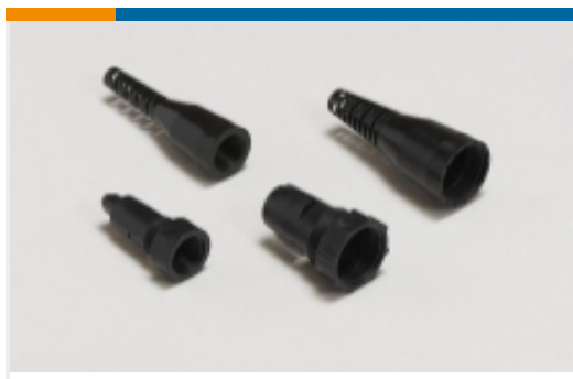
Connector Strain Relief(4)