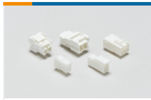
Rectangular Power Connectors(12)