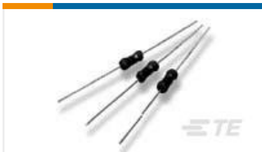
TE Part #4-1879350-2 RR01 5% 11R AMMO