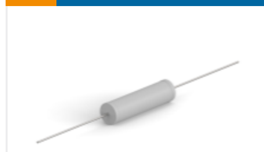
TE Part #4-2176414-8 7W STD M/OX 5% 1K8