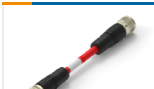
TE Part #TAA545B1411-060 M12A4-MS-FS-PVC-6.0M