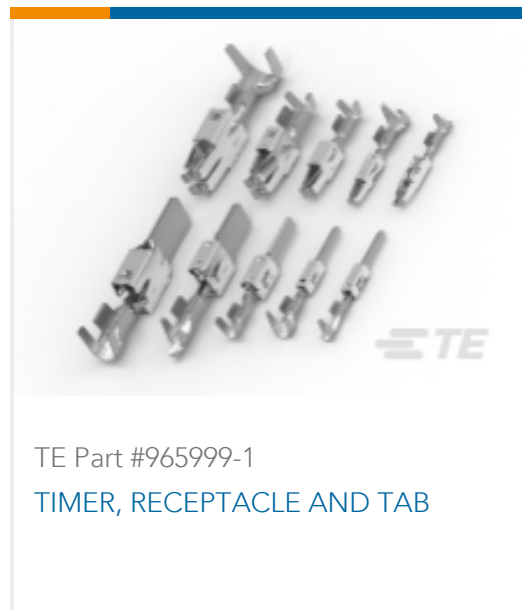
TE Part #965999-1 TIMER, RECEPTACLE AND TAB