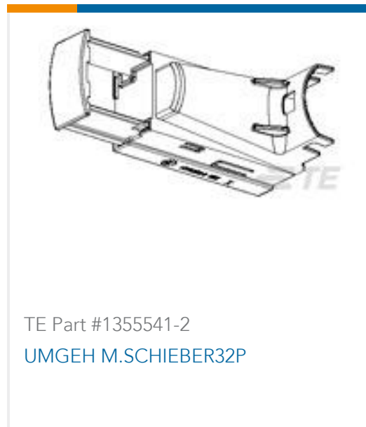
TE Part #1355541-2 UMGEH M.SCHIEBER32P