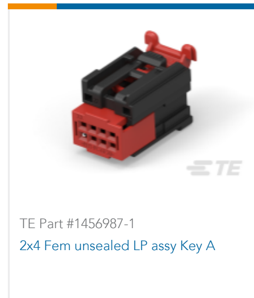
TE Part #1456987-1 2x4 Fem unsealed LP assy Key A