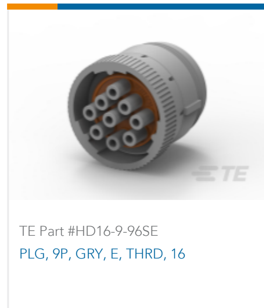
TE Part #HD16-9-96SE PLG, 9P, GRY, E, THRD, 16