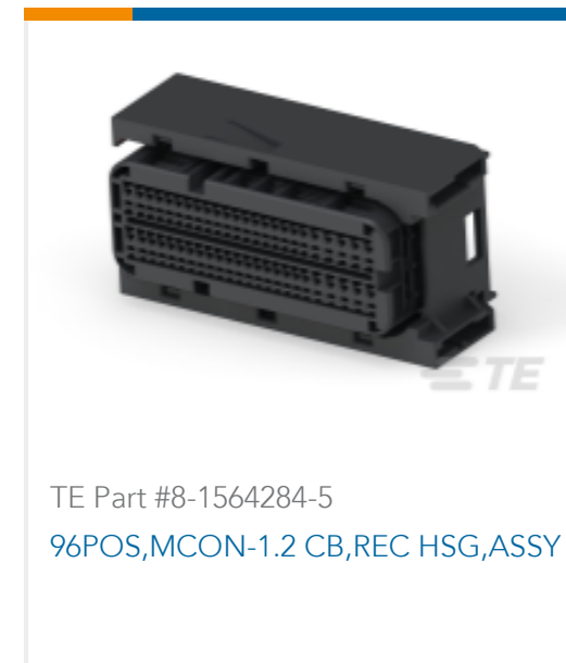
TE Part #8-1564284-5 96POS,MCON-1.2 CB,REC HSG,ASSY