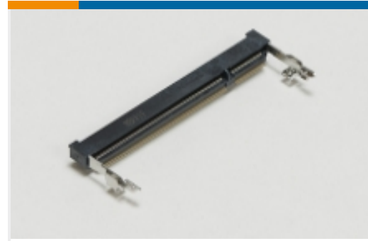
SO DIMM Sockets(13)