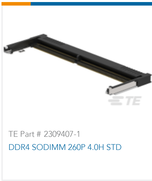
TE Part # 2309407-1 DDR4 SODIMM 260P 4.0H STD