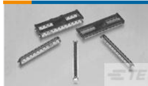
TE Part #3-1827233-6 .5FHP05H,440,B,GIG,08/Sn,HT,NS