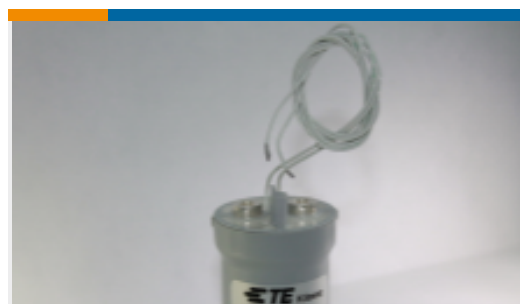
TE Part #6-1618412-9 LEV100H4ANG=CONTACTOR 12V, AUX SPST,15"