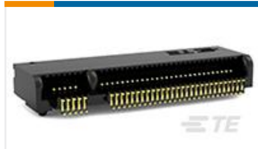
TE Part #1-2199119-6 M.2 0.5PITCH 3.2H KEY M 30U" AU