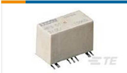
TE Part #1462051-1 HF351=50OHM140MW 3V MONO