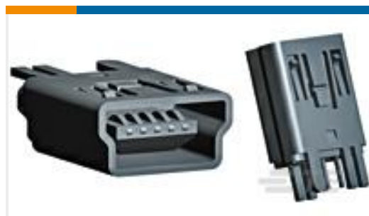
TE Part #1734753-1 MINI USB, TYPE B, VERTICAL, T/H