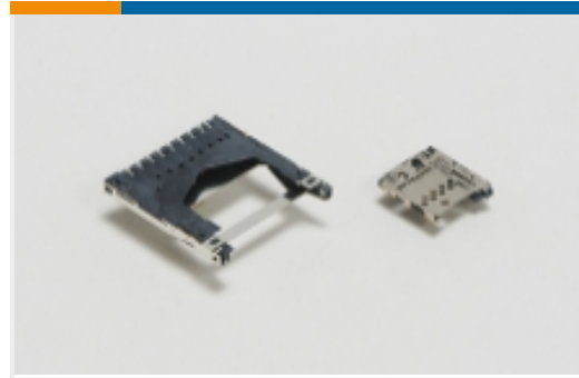
SD Card Connectors(2)