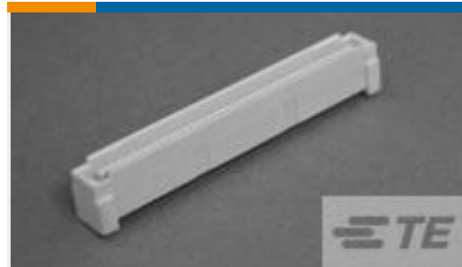
TE Part #5179031-3 0.8FH,P08H.5,080,08/Sn,TU