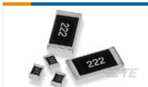
TE Part #4-1879501-3 CRGH2512 5% 56R 2W