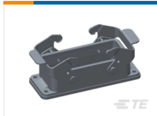
TE Part #T1410162000-000 H16B-AG