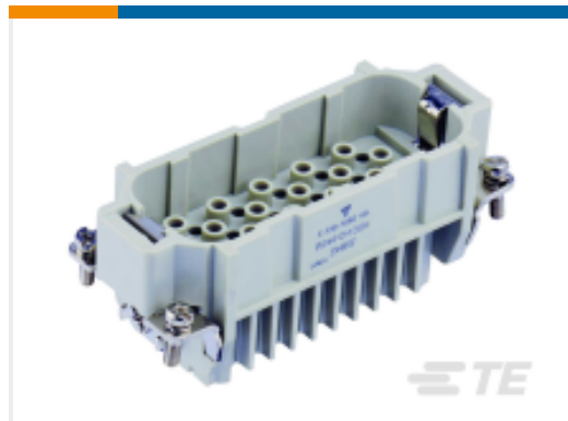
TE Part #T2020402101-000 HD-040-M