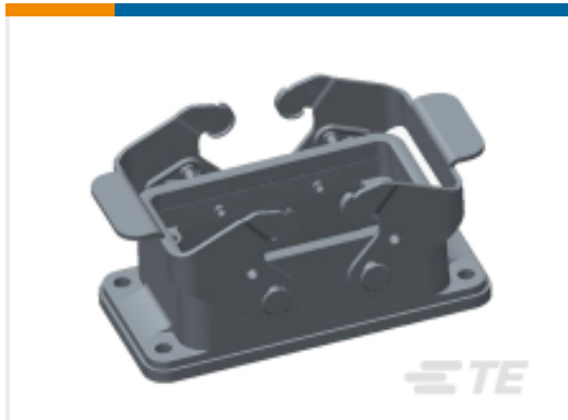
TE Part #T1410102000-000 H10B-AG