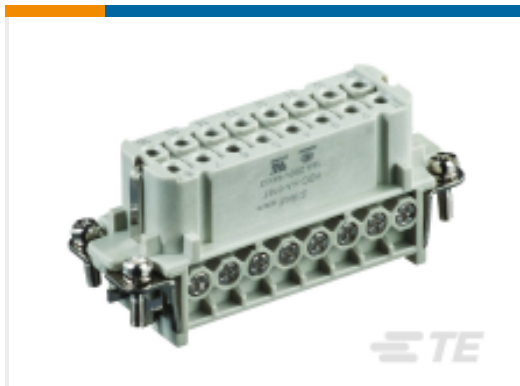
TE Part #T2010322201-000 HA-016-F 17-32