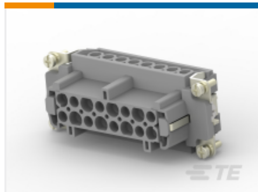
TE Part #T2040162201-000 HE-016-F