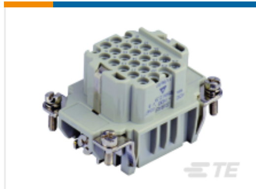
TE Part #T2030242201-000 HDD-024-F