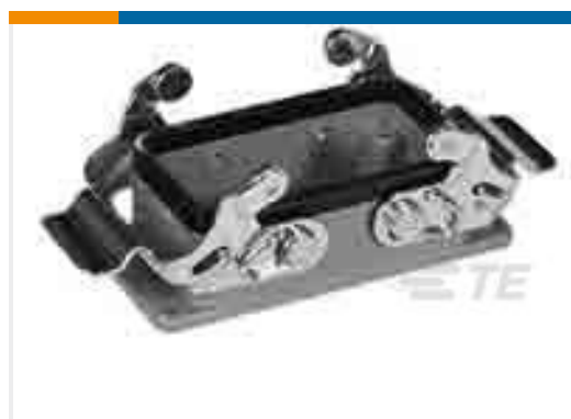
TE Part #1-1102296-1 HB.16.AG-VS