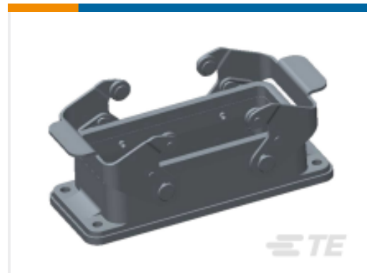
TE Part #T1410161000-000 H16B-AGS