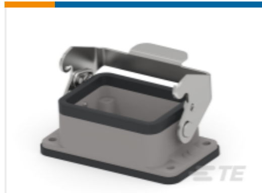
TE Part #T1500063000-000 H6B-AG