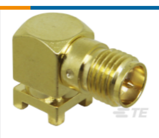
TE Part # CONREVSMA002-SMD-G RP-SMA RA Jack 50 Ohm PCB Surface Mount