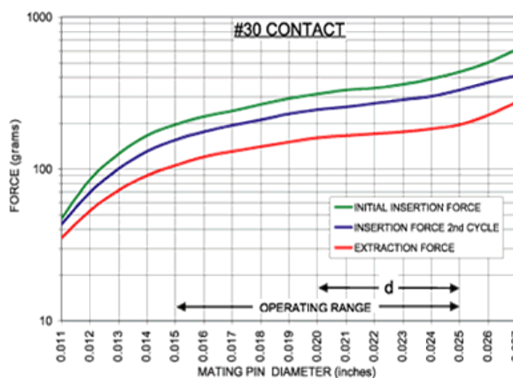
The insertion/extraction/normal force characteristics above were derived using a 30 microinch gold plated contact and polished steel gauge pins having a bullet-shaped tip.

†Since BeCu loses its spring properties over time at high temperatures; it is rated for continuous use up to 150°C. For applications up to 300°C, Mill-Max offers many contacts in Beryllium Nickel. Contact Tech Support for more info.