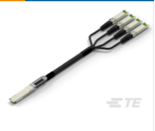
TE Part # CAT-Q17-N49011 QSFP56-Four SFP56 Cable Assembly: 30 AWG