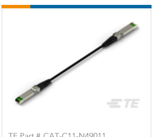
TE Part # CAT-C11-N49011 SFP28 to SFP28 Cable Assembly: 26 AWG