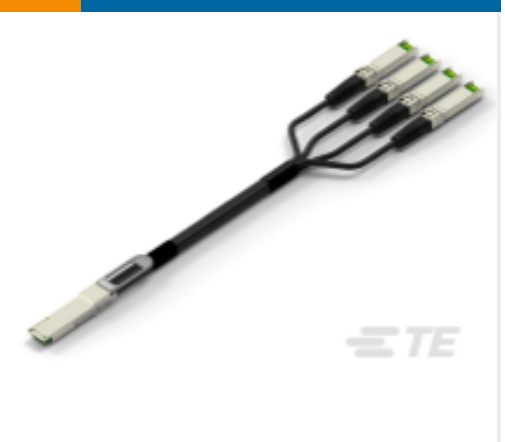
TE Part # CAT-Q17-N490333 QSFP56-Four SFP56 Cable Assembly: 26 AWG