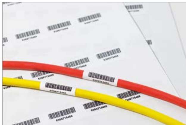
Laminating the mark gives long-term print survivability.