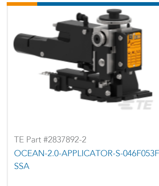
TE Part #2837892-2 OCEAN-2.0-APPLICATOR-S-046F053F- SSA