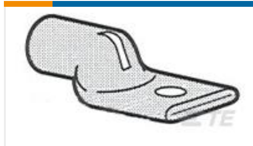
TE Part #325505 TERMINAL,AMPOWER 3/0 1/2