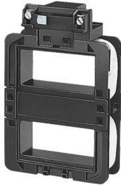
Magnet coil with switch-on electronics for contactor 3TF6844-.C..., 110...132 V AC 50/60 Hz