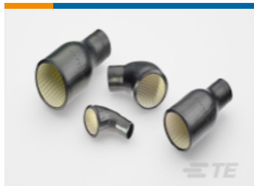
TE Part #EK7267-000 202S121-25C-0