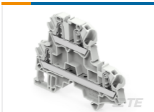
TE Part #1SNK706210R0000 ZK4-D2