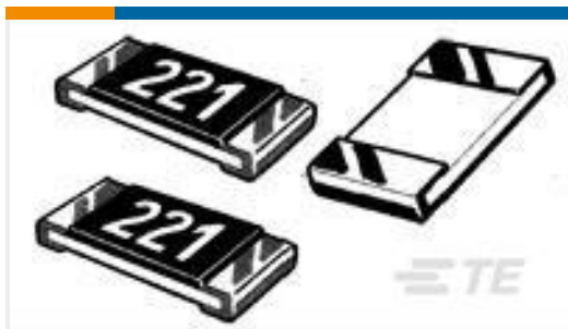
TE Part #9-2176070-4 3521 75K 1% 2W