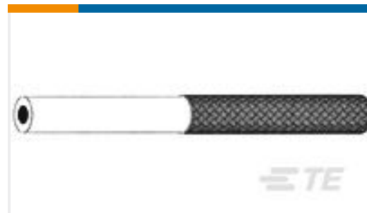
TE Part #F833213001 RAY-103-4.0(100)