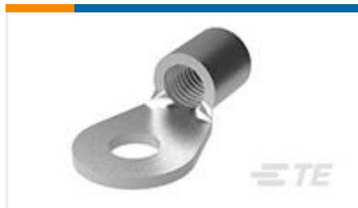
TE Part #35183 TERMINAL,SOLIS R 2 5/16