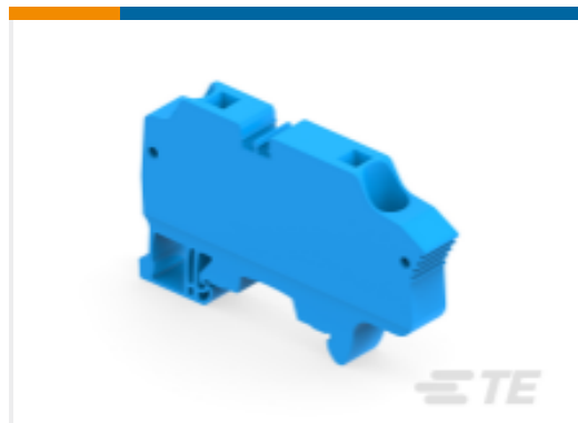
TE Part #1SNK710020R0000 ZK10-BL