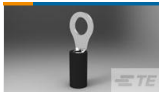
TE Part #50845-2 TERMINAL,PIDG PTFE R 12-10 10