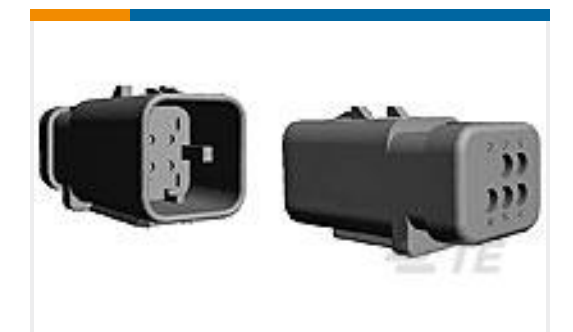
TE Part #776539-4 AS16,CAP ASSY,ST,12P,E SEAL,CODE