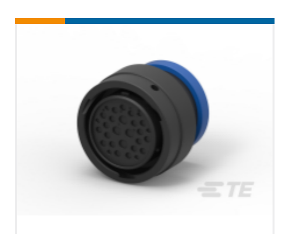
TE Part #HDP26-24-29SE-L017 PLG, 29P, BLK, E, RNG, 12/16/20, S