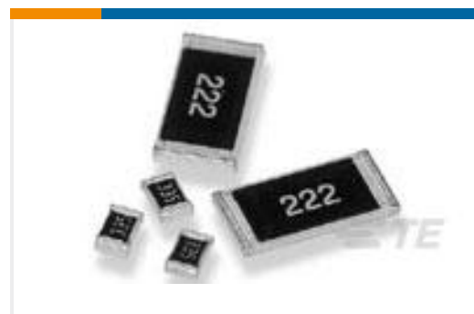
TE Part #1623257-1 CRG0805 1% 5K1