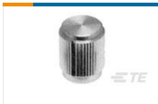
TE Part #6-1437622-0 KN700B1/4=KNOB BLACK KNURL 1/4