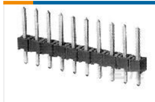
TE Part #826936-6 6P AMPMODU II STIFT LEI