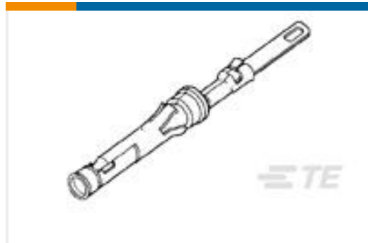
TE Part #202237-7 III+SOC,SOLTAB,30AU>10,LP,SN