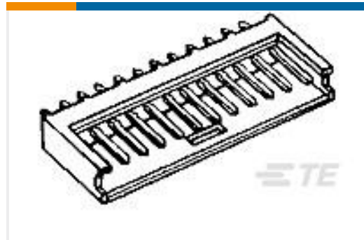
TE Part #280372-2 6P AMPMODU II SHRD HDR, ST, 0.38 AU