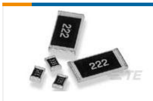
TE Part #2-1879501-9 CRGH2512 5% 15R 2W