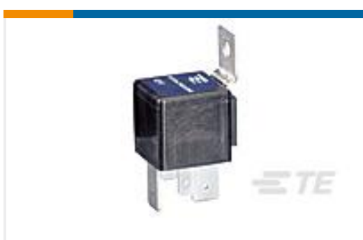
TE Part #3-1414937-3 V23134J0065X497-EV-CBOX