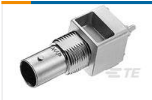
TE Part #5227673-1 BNC PCB VERTICAL JACK W/POST