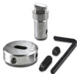
冲头，用于钻长孔：5.5 x 12 mm

Please be informed that the data shown in this PDF Document is generated from our Online Catalog. Please find the complete data in the user's documentation. Our General Terms of Use for Downloads are valid ( http://download.phoenixcontact.com )