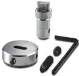
冲头，用于钻长孔：4.5 x 12 mm

Please be informed that the data shown in this PDF Document is generated from our Online Catalog. Please find the complete data in the user's documentation. Our General Terms of Use for Downloads are valid ( http://download.phoenixcontact.com )