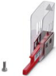
压接器 CF 500 保护盖，用于 TWIN 套管 2 x 4 - 2 x 10 mm 2 (AI-TWIN...)

Please be informed that the data shown in this PDF Document is generated from our Online Catalog. Please find the complete data in the user's documentation. Our General Terms of Use for Downloads are valid ( http://download.phoenixcontact.com )